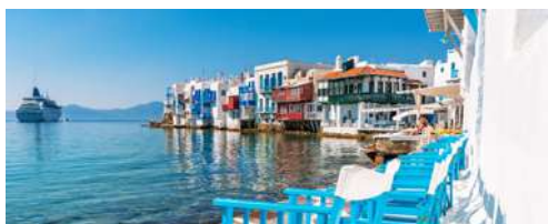
Cyclades are the most islands all over the word. True paradise, with iconic sceneries and crystal clear waters