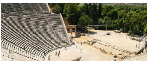
Best Sellers tour are the one that we run for other 35 year with great success and many satisfy travelers

Our big variety of tours satisfies even the most demanding client. All tours are performed even with a minimum number of two registered participants. Kindly note that you always know the total cost before the tour starts. The Hotel selection is according to the highest standards that its location has to offer. Meals and dinners highlight the gastronomical character of the area. Our tour guides are highly experienced and multilingual.